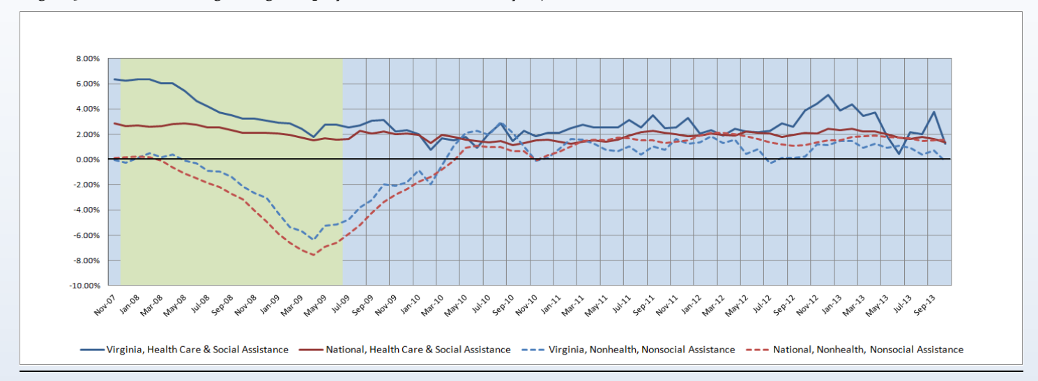
Figure 3: Six-Month Moving Average, Employment Growth, Seasonally Adjusted

The six-month moving average of Virginia's HC&SA employment growth fell significantly in October, declining by 67% to 1.3%. This represents the second-lowest level in 2013 and the third-lowest value in the past three years. Despite this decline, Virginia's HC&SA sector has outpaced the rest of the state's economy. The six-month moving average of Virginia's non-HC&SA employment fell into negative territory in October for the first time since July 2012. The six-month moving average of national HC&SA employment also fell in October, but this decline was a relatively modest 15%. Meanwhile, the national non-HC&SA sector saw a slight uptick in its six-month employment moving average, increasing from 1.5% to 1.6%.