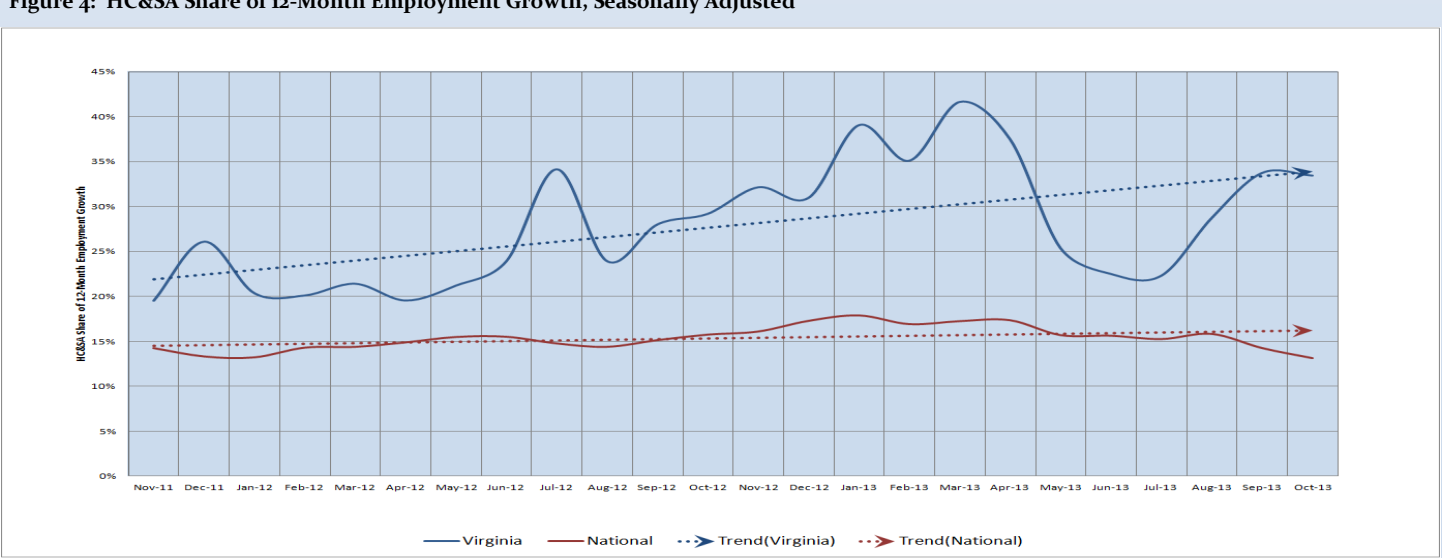
Figure 4: HC&SA Share of 12-Month Employment Growth, Seasonally Adjusted

Over the past two months, the share of Virginia's employment growth that is attributable to the HC&SA sector has stabilized to approximately one-third. Although Virginia's HC&SA share did decline slightly to 33% in October, this is still 50% higher than the year-to-date lows seen during the summer. This is also far higher than the national average, where the HC&SA sector is currently responsible for 13% of all employment growth over the past 12 months. Unlike Virginia's HC&SA sector, the national HC&SA employment share has been falling in recent months. In fact, since the beginning of the year, the national HC&SA share has fallen from 18% to 13%, a decline of 28%.