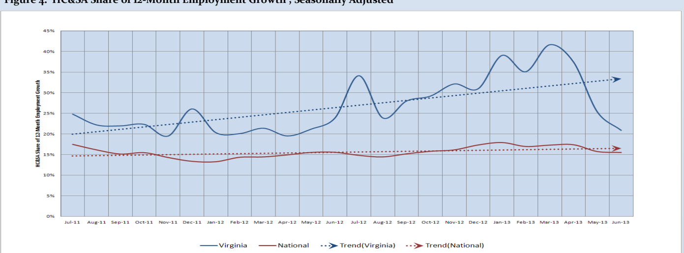
Figure 4: HC&SA Share of 12-Month Employment Growth, Seasonally Adjusted

· Virginia, Health Care & Social Assistance —— National, Health Care & Social Assistance --- Virginia, Nonhealth, Nonsocial Assistance --- National, Nonhealth, Nonsocial Assistance